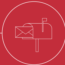
Direct Mail Pieces