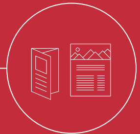
Brochures & Flyers