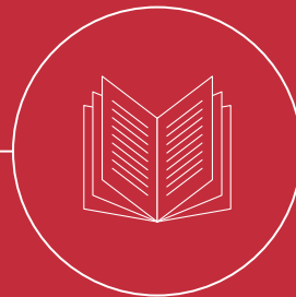
Programs & Reports